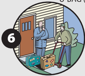
3 or... excess baggage delivered to passenger's home