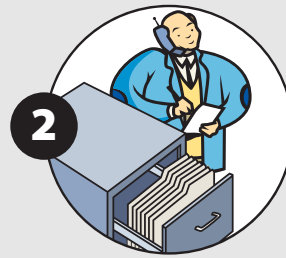
2 U-BAG books with Airline