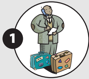
1 Passenger calls U-BAG (phone or online)