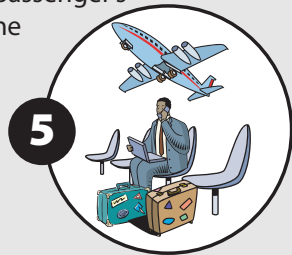
5 Passenger collects at airport